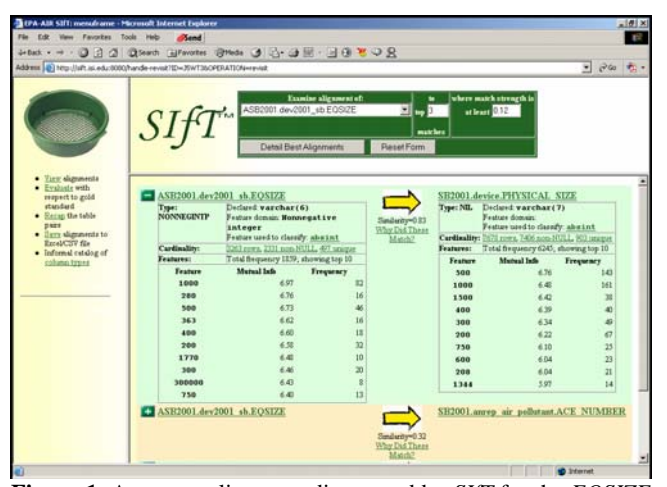
Figure 1. A correct alignment discovered by SlfT for the EQSIZE column in the CARB database to the Physical Size column in the SBCAPCD database.